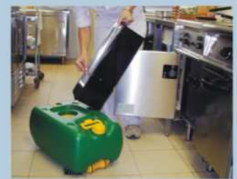
It simplifies the disposal of waste cooking oil coming from fryers