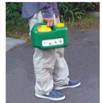
Easy to transport