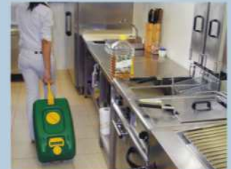
The trolley handle makes any move easier even when full