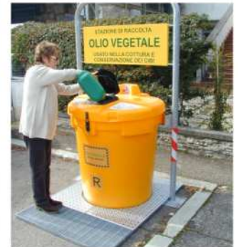
The anti-slip grille allow the maximum safety when operating