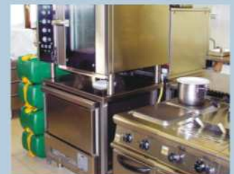
It can be stacked for a better positioning (maximum stackable quantity: 4 tanks)