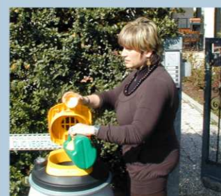
Wide cap to pour the waste vegetable oil and filter to improve its quality

The NCP cover, made of PP SUITABLE for resisting to ATMOSPHERIC agents, was designed to increase the SAFETY of the user when handling containers (namely to increase glass safety) and to facilitate the disposal by improving the different kinds of waste (it is possible to have different colours for different types of waste). NCP can be used (after suitable check) with great benefits on different kinds of already existing containers, (such as bins for glass collection, paper collection, etc.) as a matter of fact it has a special ANTI-OVERTURN BLOCKING DEVICE preventing the cover from remaining open; it also has a special groove for the application of a gasket that makes the cover fully watertight, thus PREVENTING rainwater from entering the containers and making POSSIBLE HAZARDOUS LIQUIDS overflow on the ground causing pollution. This also prevents the proliferation of TIGER MOSQUITOS which usually tend to settle naturally in containers with stagnant water.