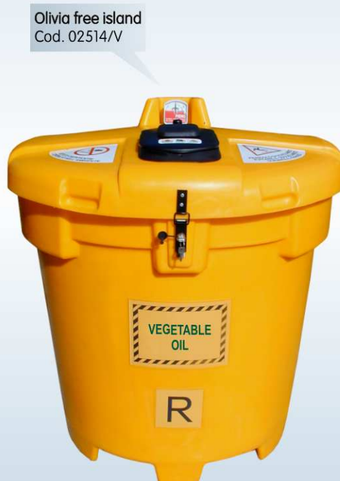
Olivia free island Cod. 02514/V