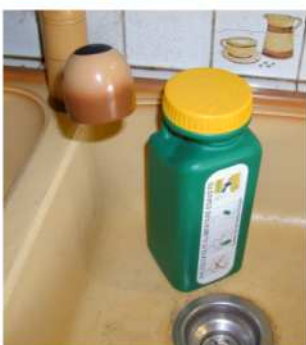
Small, handy and compact, ideal for those having little room