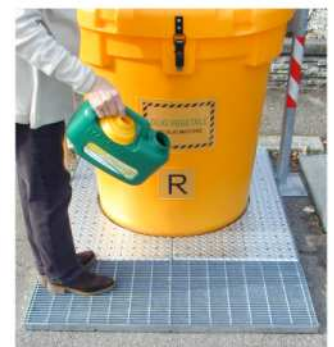
Rainwater does not stagnate thanks to the special containment tank