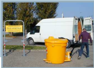
Ideal for the "full for empty" collection