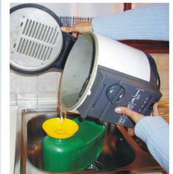
Filter your waste oil with the special accessories