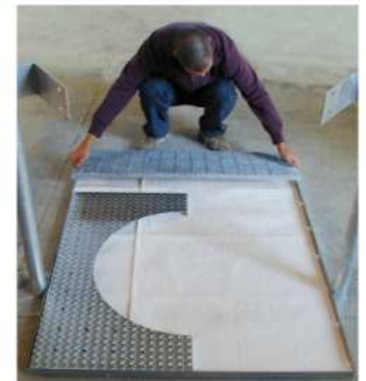
Footboards can be easily removed in case of need