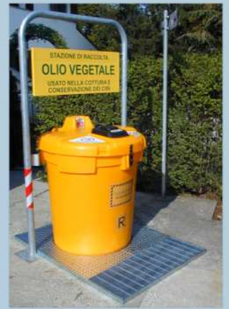
Made of galvanized steel to increase weatherproof resistance