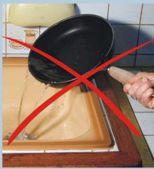
Pouring waste oil in drainpipes is highly polluting