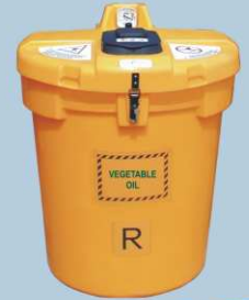
Olivia 200 island