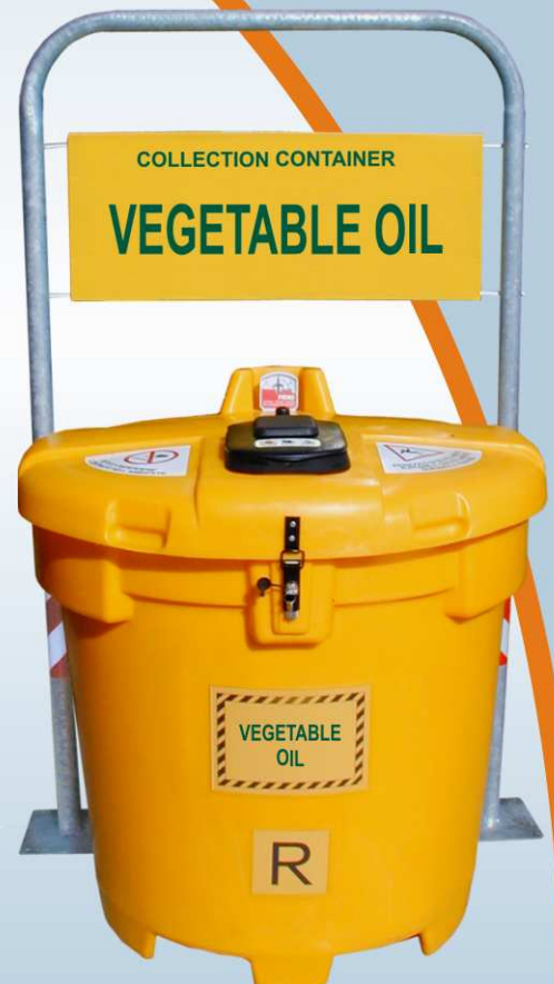
Olivia free Cod. 02512/V

It is made of two containers, one embedded into the other. The outer container (upper diameter 125 cm. lower diameter 105 cm height 135 cm roughly) has a capacity of 800 litres and works as a containment tank. It was DESIGNED to be easily released and transported through a TRANSPALLET once FULL.