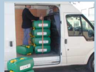
Easy and safe fastening through loading fixing belts

Available colours are Special colour customizations are available upon request.