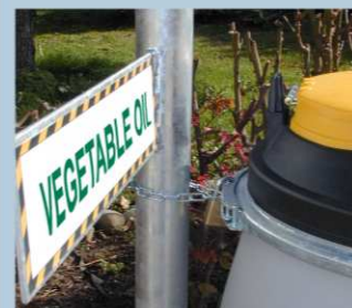
Galvanized steel snap-hook closure preset for padlock use