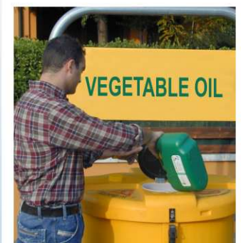
Take it to authorized collection centres or ecological islands