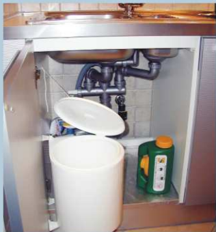
Handy and small