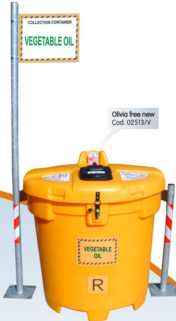
Olivia free new Cod. 02513/V