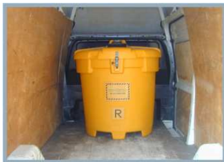
Easy to transport