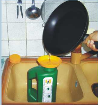
Filter and collect with the special funnel