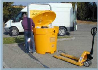
Easy to release