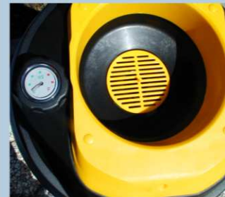
Level gauge to monitor internal oil quantity