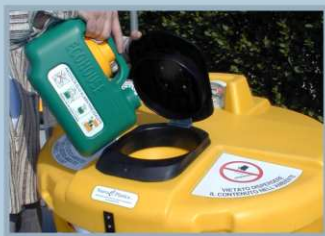
Vegetable oil can be easily collected

CONTAINER FOR THE SEPARATE COLLECTION OF WASTE VEGETABLE OIL IT HAS A SPECIALLY SHAPED BASE FOR TRANSPALLET LIFTING