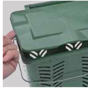
Lid recesses on three sides for simple finger-tip opening

Stelo 7 vented kitchen caddy has been created to simplify the segregation and collection of food wastes optimising aerated conditions to reduce moisture and unpleasant smells.