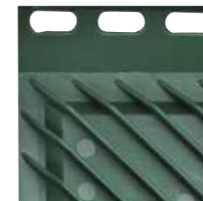
Ribs allow total air circulation at the base