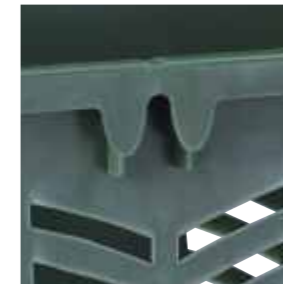
Wall or door fixing points