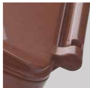
Sturdy hinges and clip-on lid

Urba 20, 23 and 25 containers ergonomically designed with tapered shaped body and square base with minimal footprint. They can be used in all types of properties, either inside or outside the home or office.