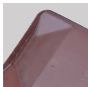
Recessed hand grip on the base