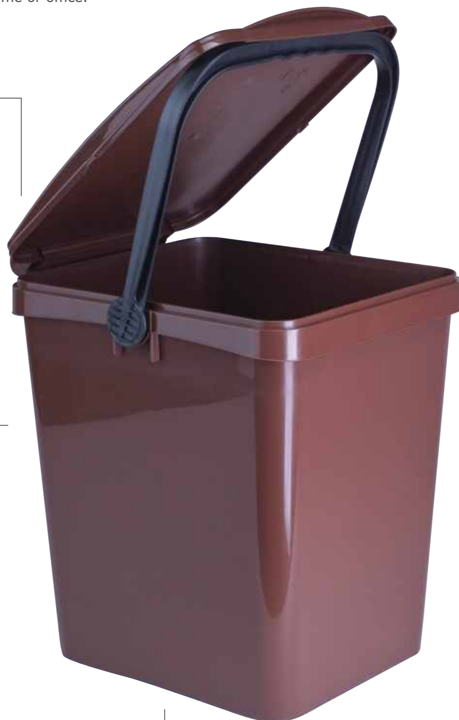
Lid or body with IML printing option