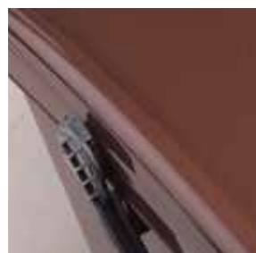
Robust handle with lid locking mechanism