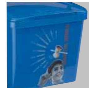
Lid or body with IML (injection moulded label - option)