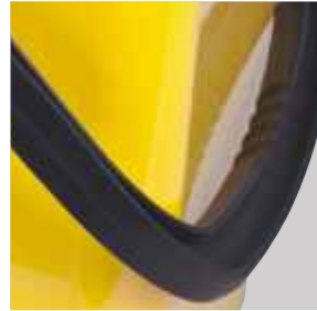
Robust handle with secure grip for working with gloves