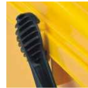
Pivot and handle with automatic locking mechanism