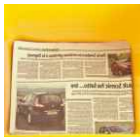
Rectangular base with optimum capacity for newsprint