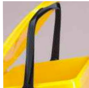
Vertical handle with two lid opening and locking positions