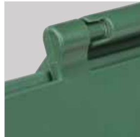
Sturdy hinges and clip-on lid, removable for easy cleaning

The Urba 7 kitchen caddy with solid wall and lid, for safe and easy food waste segregation. It can be placed on the kitchen worktop or mounted inside a cupboard, under the sink or on the wall. An extra wide aperture allows filling from dinner sized plates and chopping boards.