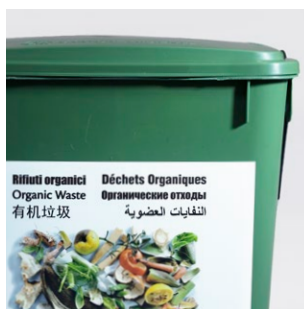
IML (In Mould Labelling) up to 4 colours.