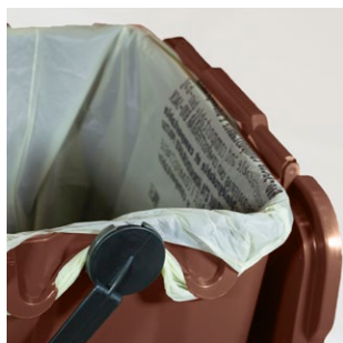
Fastening system for T-shirt style handle.

The kitchen caddy for food waste collection