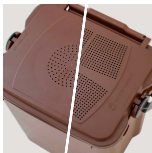
Available lid designs - Solid, ventilated or fitted with filter.